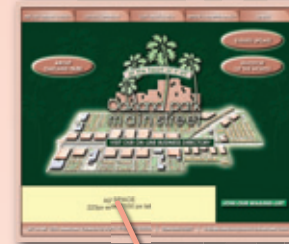
Home Page Banner